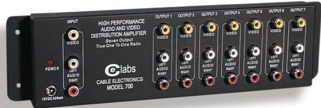
AV400 & AV700 Composite Video/Audio Distribution Amplifiers